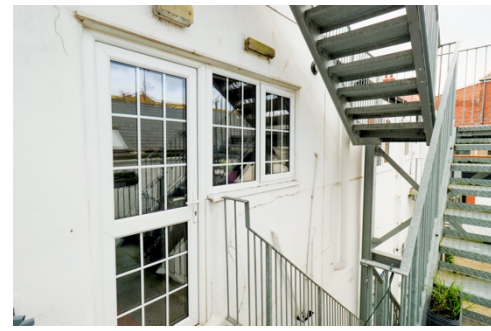
Council Tax Band A.