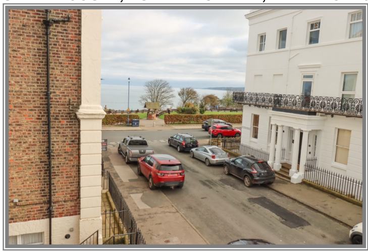
Freehold OIRO £210,000