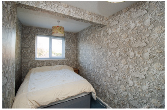
/ continued over