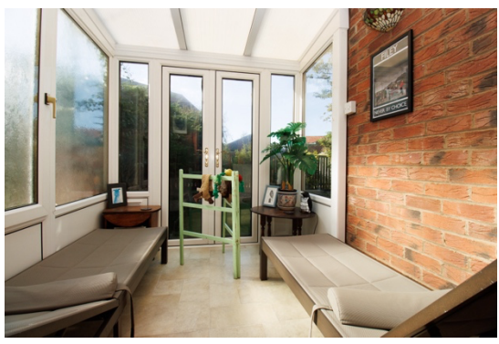
CONSERVATORY 2.79m x 2.10m (9'2" x 6'11")

Upvc double glazed windows. Upvc double glazed doors to garden.