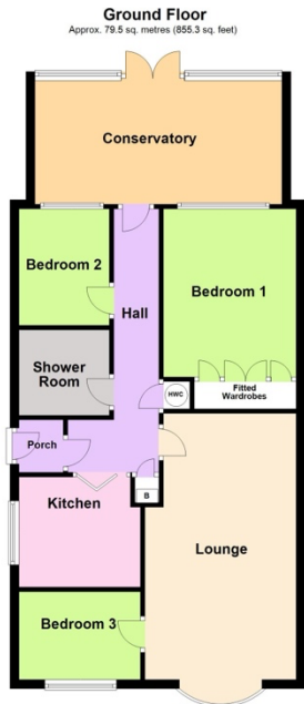
Total area: approx. 79.5 sq. metres (855.3 sq. feet) Please note this floorplan is a guide and not to scale. Plan produced using PlanUp. 16 Ambrey Close, Hunmanby