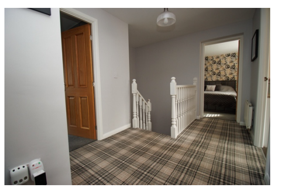
/ continued over

Built-in cupboard housing the hot water tank. Radiator. Loft access with pull down ladder, fully boarded.