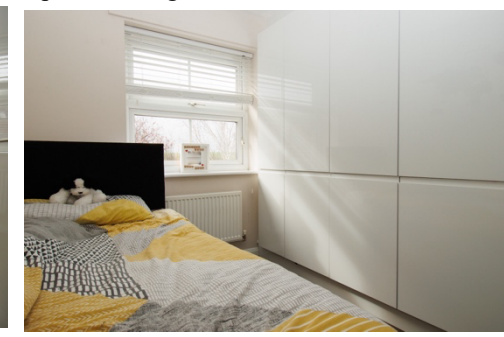
/ continued over