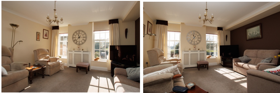
Flat S3, The Quadrangle, Hunmanby Hall, Hunmanby - continued