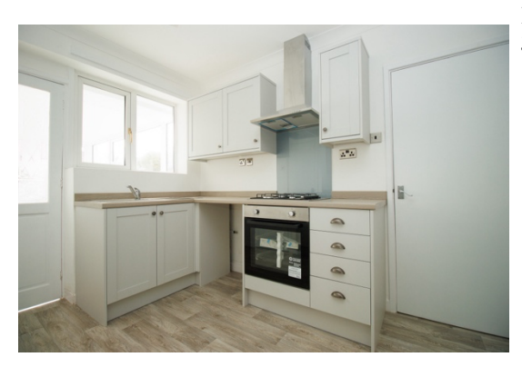
KITCHEN 3.65m max x 2.79m (12'0" max x 9'2")

Inset stainless steel sink. New modern base cupboards with worktops over. Matching wall cupboards. Pantry. Built-in electric oven. Gas hob with stainless steel extractor hood above. Plumbing for an automatic washing machine. Space for 'fridge / freezer. Cupboard housing gas combination boiler. Radiator.