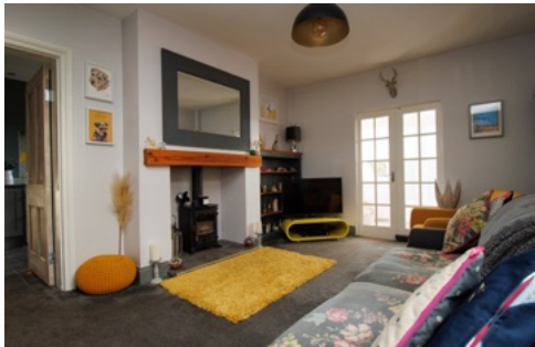
Door to Side Porch