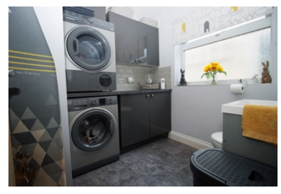
UTILITY ROOM / WC 2.18m x 1.67m (7'2" x 5'6")

Handbasin and we in vanity unit. Plumbing for automatic washing machine and dryer. Base cupboard with worktop over and matching wall cupboard. Inset spotlights. Heated towel rail. Upve double glazed window.