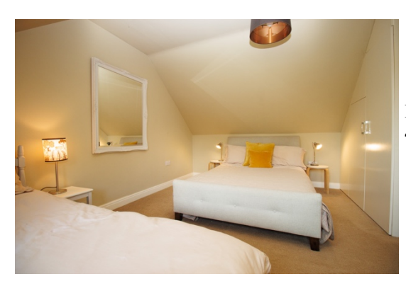
BEDROOM THREE 4.08m x 3.35m (13'5" x 11'0")

Fitted wardrobes. Radiator. Upvc double glazed window.