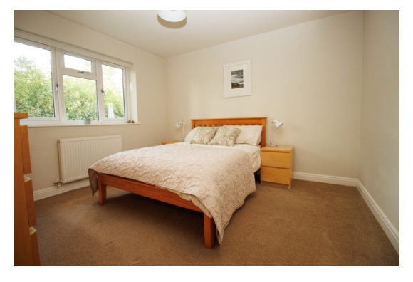
BEDROOM ONE 3.40m x 3.53m (11'2" x 11'7")

From Filey take the A165 road towards Bridlington. Turn left at the roundabout after left hand side.