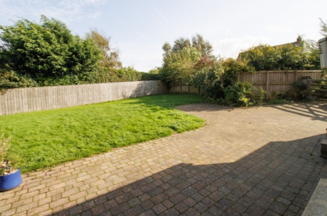
/ continued over