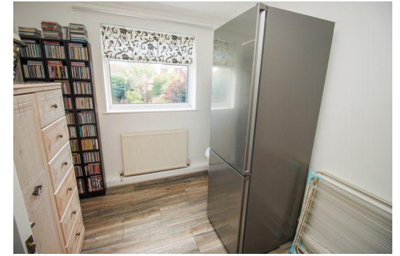
BEDROOM THREE 3.04m x 2.43m (10'0" x 8'0")

Laminate floor. Radiator. Upvc double glazed window.