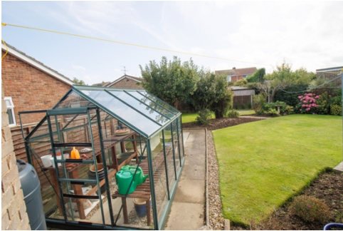
Council Tax Band C.