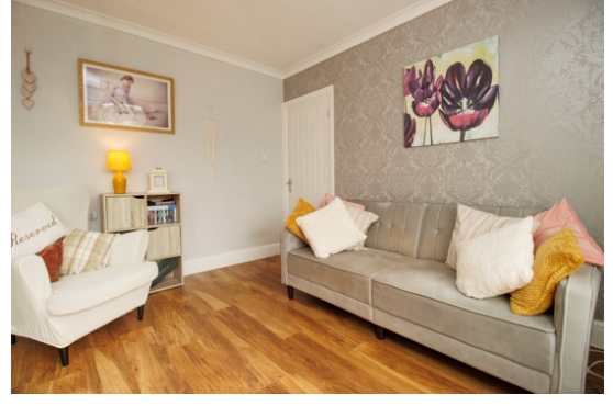
BEDROOM ONE 3.65m x 3.65m (12'0" x 12'0")

Built-in wardrobes with sliding mirror doors. Laminate flooring. Radiator. Upvc double glazed window.