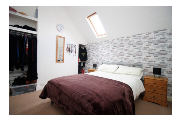
BEDROOM ONE 3.15m x 2.84m (10'4" x 9'4")