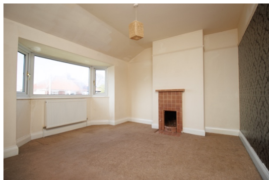
BEDROOM ONE 3.63m x 3.07m (11'11" x 10'1") plus bay.

Feature fireplace. Radiator. Upvc double glazed bay window.