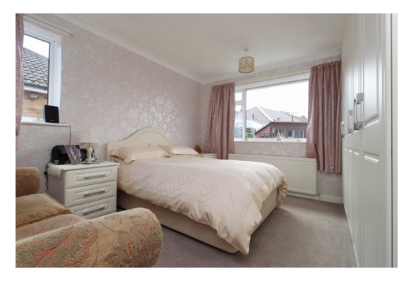
BEDROOM ONE 3.93m x 3.32m (12'11" x 10'11")

Fitted wardrobes. Radiator. Upvc double glazed rear window and smaller upvc double glazed window to the side.