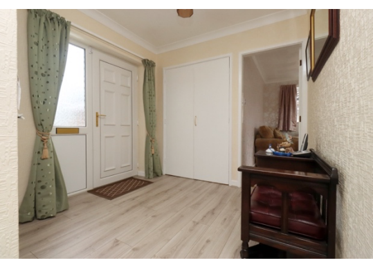
5.53m x 3.45m (18'2" x 11'4")

Coats cupboard. Cupboard housing combination boiler.