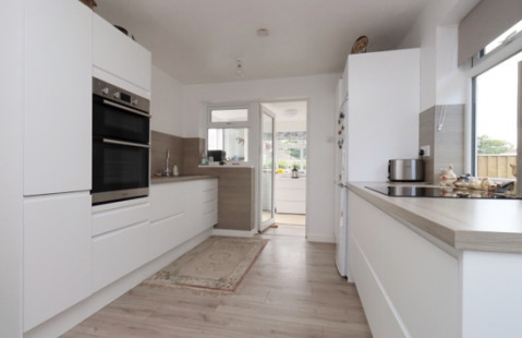
/ continued over